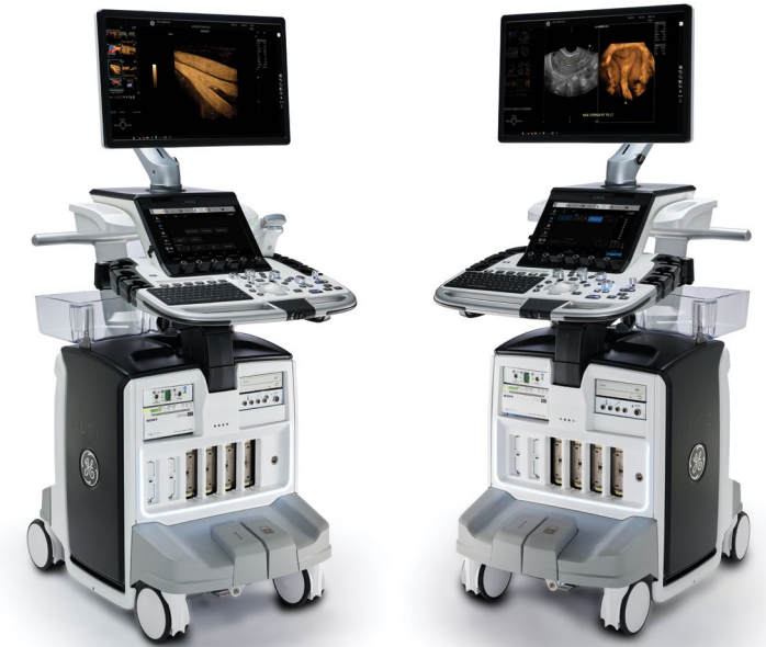
LOGIQ™ E10 Ultrasound